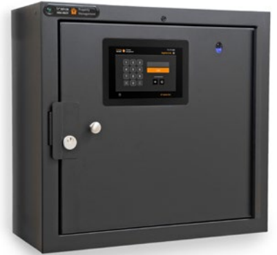
MXi Standard Secure up to 128 key sets