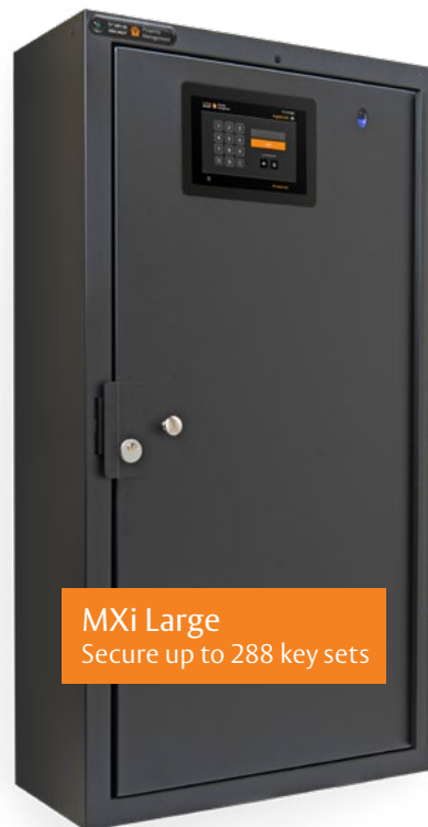
MXi Large Secure up to 288 key sets