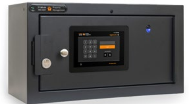
MXi Mini Secure up to 32 key sets