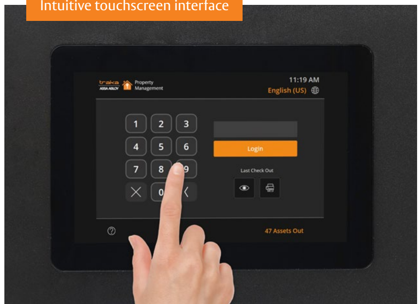
Intuitive touchscreen interface