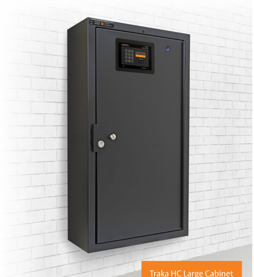
Traka HC Large Cabinet Secures up to 504 key sets