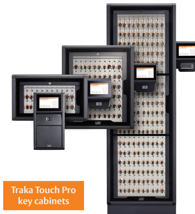
Traka Touch Pro key cabinets