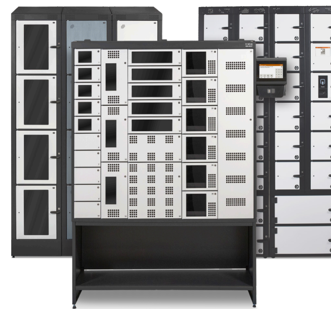
Traka intelligent locker systems