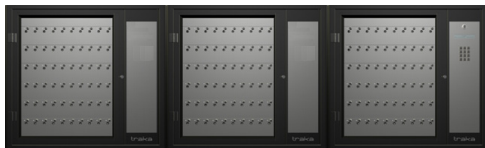
Fig 2. S-Series system with 2 extension cabinets example

Extension cabinets can be connected to the S-Series system allowing up to a maximum of 540 keys to be managed from a single control pod.