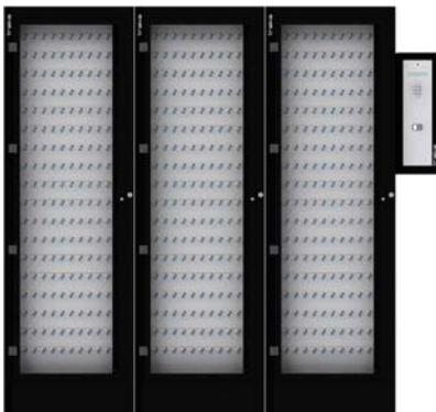
L-Series system with 2 extension cabinets

Extension cabinets can be connected to the L-Series system allowing up to a maximum of 540 keys to be managed from a single control pod.